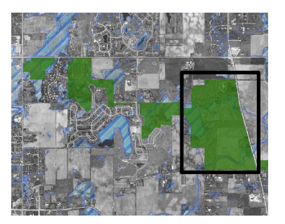
Raven Glen 575 Acres